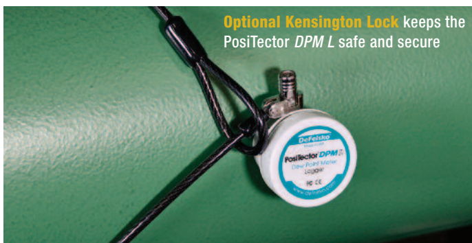
Optional Kensington Lock keeps the PosiTensor DPM L safe and secure

Operating Range: -10° to 60° C (14° to 140° F)